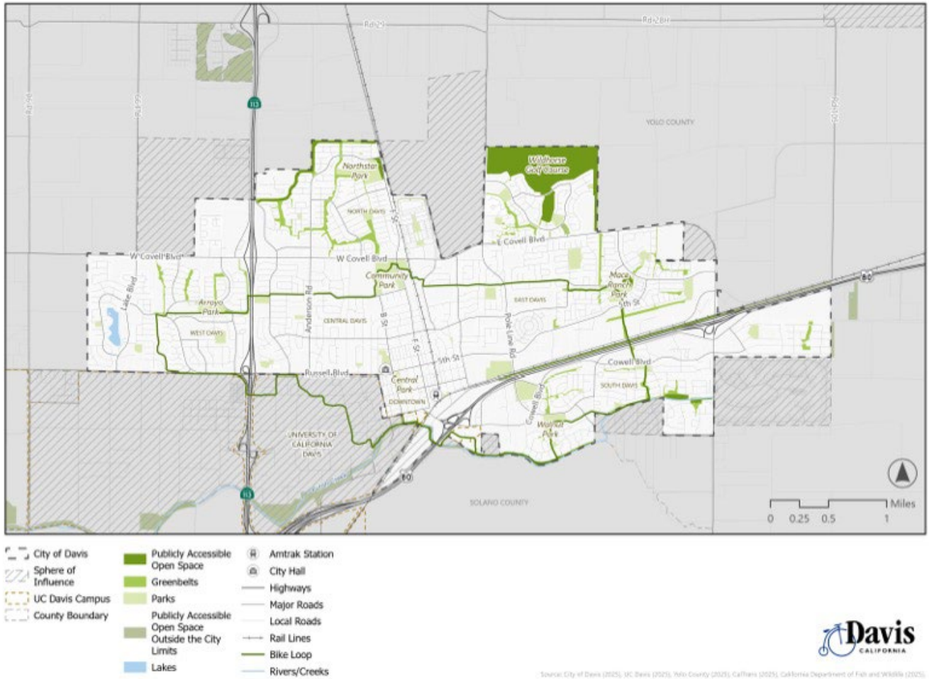
Figure 1 Davis General Plan City Basemap